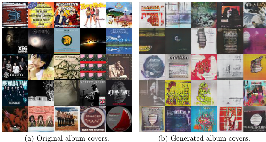
Fig. 1. AC-GAN trained on the OMACIR dataset.

is taken from a uniform distribution in the region (-1, 1) . Overall the resulting images in Fig. 1 are of good visual quality with minimal repeated textures and have properties which are indicative of album covers.